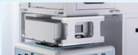
3110 with tri-temp chamber & tester