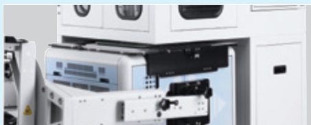
3110 with tester