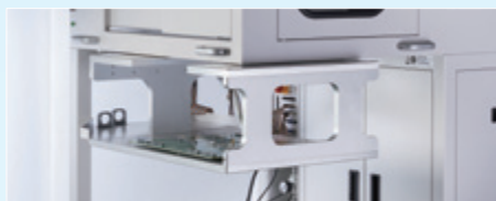
3110 with module board