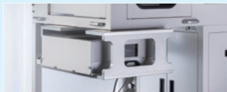
3110 with tri-temp chamber