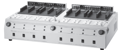
A802001 : 4+4 Multi-UUT Test Fixture

* Please refer to Model 8000's specifications for detail instruments